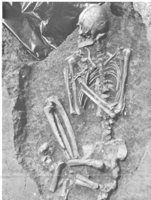
Leg bones broken by a plow's disc show how burials are being destroyed at Hunting Creek. Preliminary investigations suggest this was the burial site of a woman who died about 1,500 A.D.

The project gave, as well, an opportunity to assist the Office of State Archaeology in training Soil Conservation Service personnel in the recognition and protection of archaeological sites within soil management program districts. The SCS filmed much of the work and plans to incorporate it into its