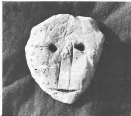
Found on the surface, this 3"x 2" soapstone effigy is a unique find.

cultural features and 64 postholes. Most notable among the features dug this past season was a large shell and trash midden containing a variety of artifacts, including mussel shell and animal bone, bone tools, pottery, stone tools, two articulated turkey skeletons, and five intrusive burials.